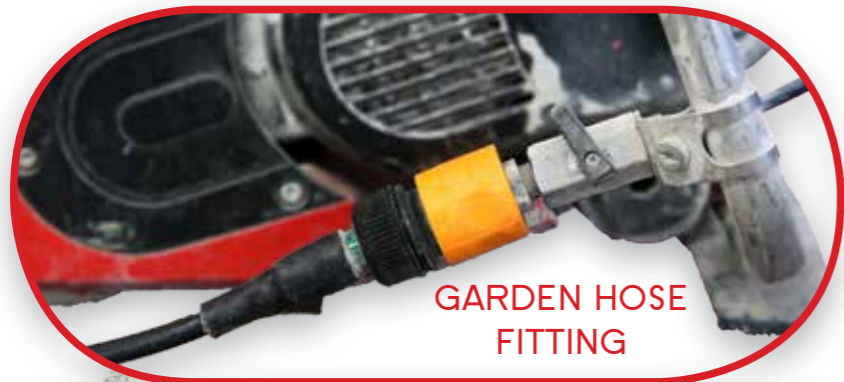
GARDEN HOSE FITTING