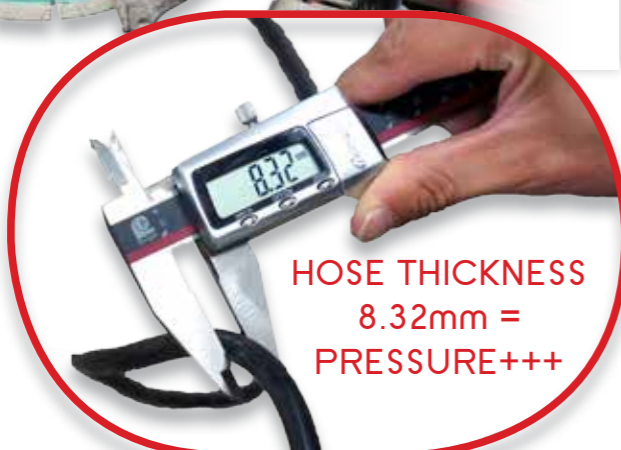
HOSE THICKNESS 8.32mm = PRESSURE+++